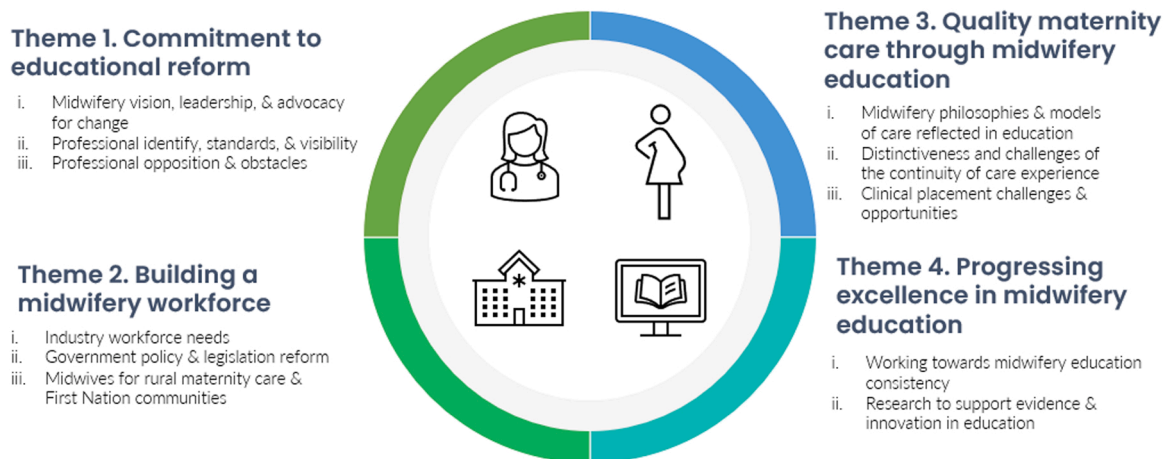
Fig. 2. Themes and sub-themes.

Key to abbreviations: PR-Primary Research, SR Secondary research, FGD Focus Group Discussion