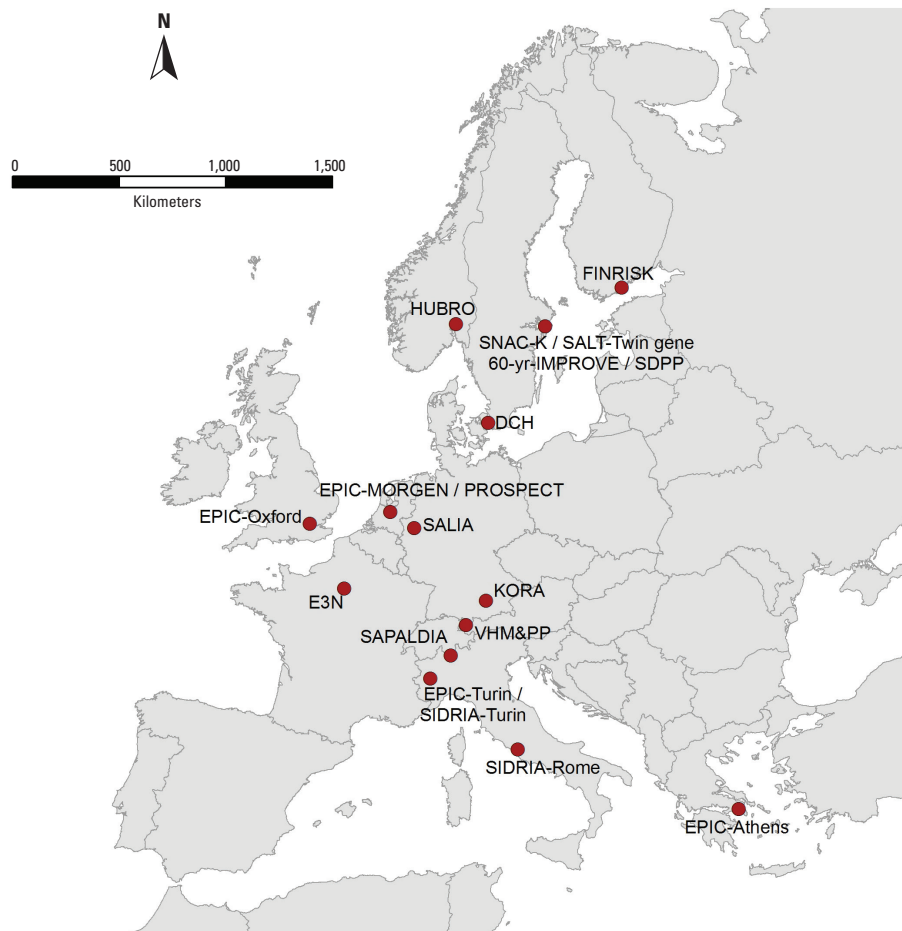
Figure 1. Cohort locations in which elements were measured.

Single-pollutant results. Positive HRs were estimated for almost all exposures, with a statistically significant association for