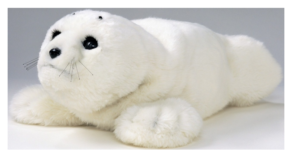
Figure 2. Paro.

in means [24]. The Paro intervention had a positive clinically meaningful influence on quality of life, emotions, pleasure and anxiety [22].