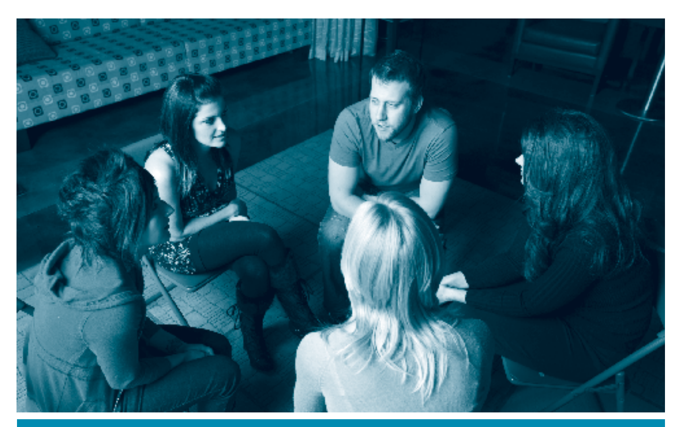
Participants described themselves as being responsible for providing financial support, taking on household tasks, ensuring the safety of their alcohol/drug-using parent, supervising and supporting their siblings, and providing emotional support and personal care.

comes around ... I got scared ... I didn't like being at home by myself. (Girl, aged 13)