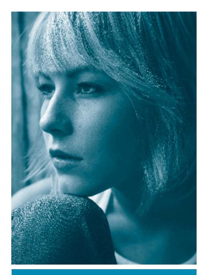
This project highlights the value of enabling young people to express their views, identify their needs and provide important information about what they think would assist them.

going, "Well, why the hell are you here then?" They are no good for anyone. That's what you're initially supposed to do—contact them or whatever, so why would you bother? (Young man, aged 17)