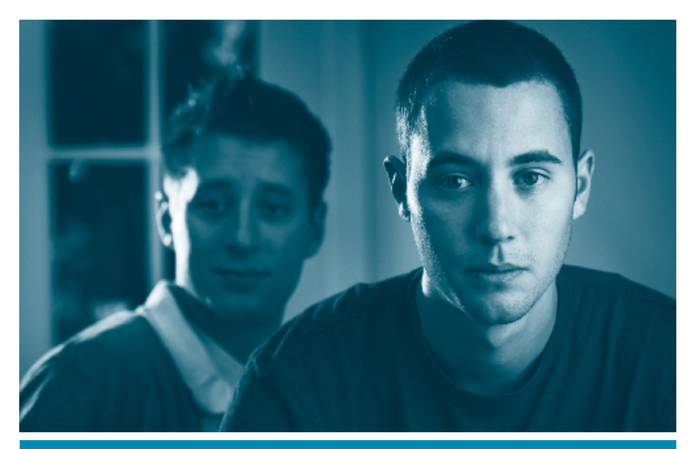
Young people want to know that services are prepared to listen to what is going on for them at home and to know that they will take a broader and more holistic view of their lives.