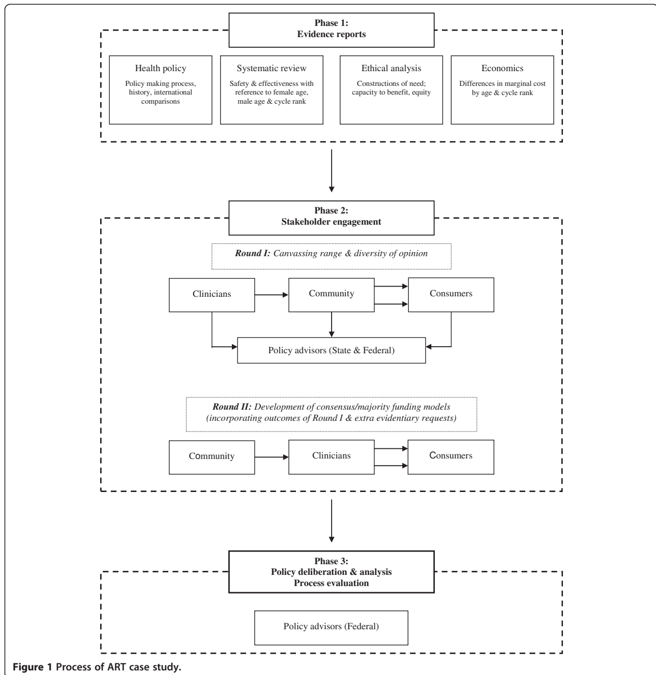
Figure 1 Process of ART case study.

In order to avoid capture by vested interests, to maintain a power balance, and to cater for differing levels of expertise, stakeholders were consulted in separate engagements. Potentially partisan stakeholders were not mixed with lay citizens, but the ideas generated by each group were communicated to the subsequent groups to share knowledge and allow cumulative solutions to be constructed.