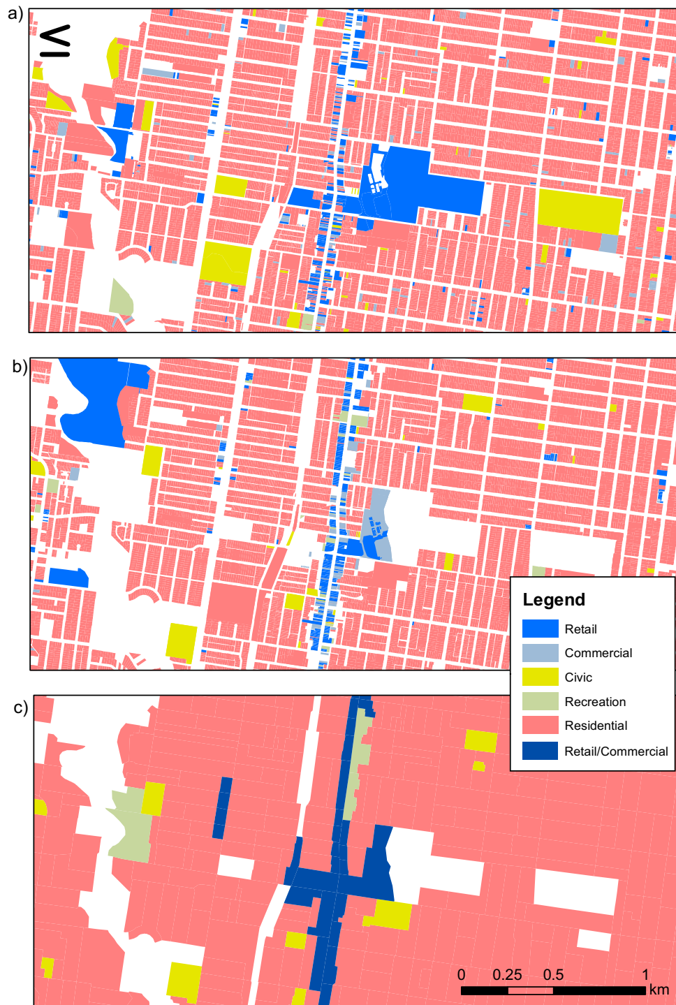
Figure 1: Comparison of land use representations of: a) benchmark; b) custom; and c) meshblock land-use datasets in an inner Melbourne suburb. “Recreation” = Parkland in the meshblock dataset.

Differences in land use representation between the datasets are further demonstrated for an area in an inner Melbourne suburb (Figure 1) and Melbourne central business district (CBD) (Figure 2). The benchmark and custom land-use datasets are finer-grained as they relied on point or property level data, while the meshblock dataset used area level data. All datasets revealed the same general geographic patterns including the main commercial and residential areas. However, Figure 2 shows that the meshblock dataset does not adequately capture the mixture of land uses in the CBD.