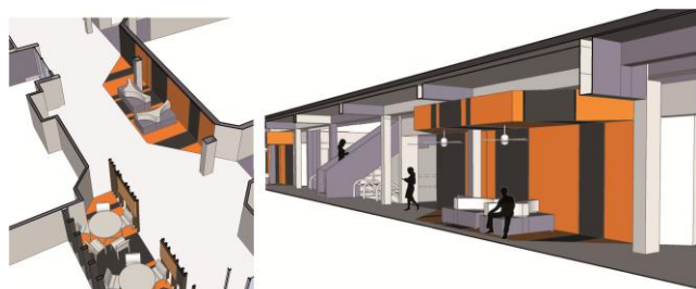
Figure 3. Eddy Spaces in Education

The SKG Project's 'aesthetics' principles include symmetry, harmony, simplicity and fitness for purpose. These are evident in the design in a number of ways, for example in the selection of high quality café style furnishings and floor coverings and the inclusion of the outdoor 'learning terrace' in the FBEL Learning Commons, which has fixed seating and bench space. These qualities are vital because there is evidence that students experience comfortable, functional, and aesthetically pleasing spaces as institutional interest in their experience and thus as a proxy for institutional respect (Souter et al. 2011). This in turn relates to student perceptions of institutional interest in their learning.