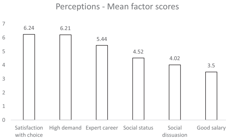
FIGURE 2 Perceptions about teaching career.

My main reasons for teaching are that I have always wanted to be a teacher, particularly within art since I was in primary school as it allowed me to pursue a career that would allow me to work with children. I knew that I wanted to work with my subject in art and encourage students to be unique and express themselves. (Participant, PGCE)