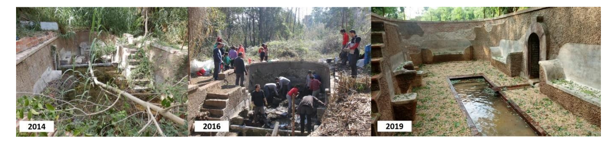
Figure 2. The spring of Can Moritz when first cleared of vegetation in 2014, during reconstruction in 2016 and after the restoration was completed in 2019.

Around the mid-1950s, the family sold the property, and the land was parcelled out, which resulted in the house of Can Moritz remaining in private ownership, currently catalogued as the archaeological heritage of Rubí. By contrast, the surrounding plots were sold and developed as a low-density garden city or suburban housing. The spring belonging to Can Moritz ended up in public land, as it was located next to a seasonal stream. The stream basin was integrated into the state hydrological water protection area and thus remained cut off from the summer house system. Scarcely noticed by local people, it was soon abandoned and gradually infilled and overgrown, that it was utterly lost. In December 2014, after a massive heavy storm, the spring and its modernist recreational structure were rediscovered by residents. In 2016 a local NGO, Rubí d'Arrel, instigated the first restoration intervention with volunteers by removing the vegetation, and cleaning the spring and the surroundings, unveiling the 1922 design for recreational uses around Can Moritz's spring (Figure 2). Simultaneously, the area across the stream was identified as needing some environmental improvements—in part, so that a footbridge could be laid to improve access to the spring (which was at the base of a steep slope), and to revitalise and restore the landscape.