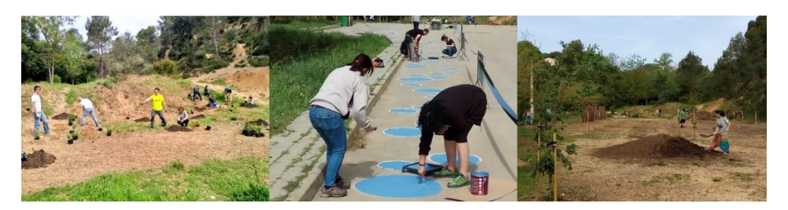
Figure 7. Intervention in the surroundings of the spring, with the participation of the locals (clearance of rubbish, painting of circles on the car park surface, and tree and shrub planting).

Figure 6. Masterplan of the interventions in the spring's surroundings following the conclusion of the visual preference mapping (VPM) analysis (P indicates parking lot area). The bubbles are blue circles painted onto the surface of the car park, and the other circles are the positions of the painted logs.