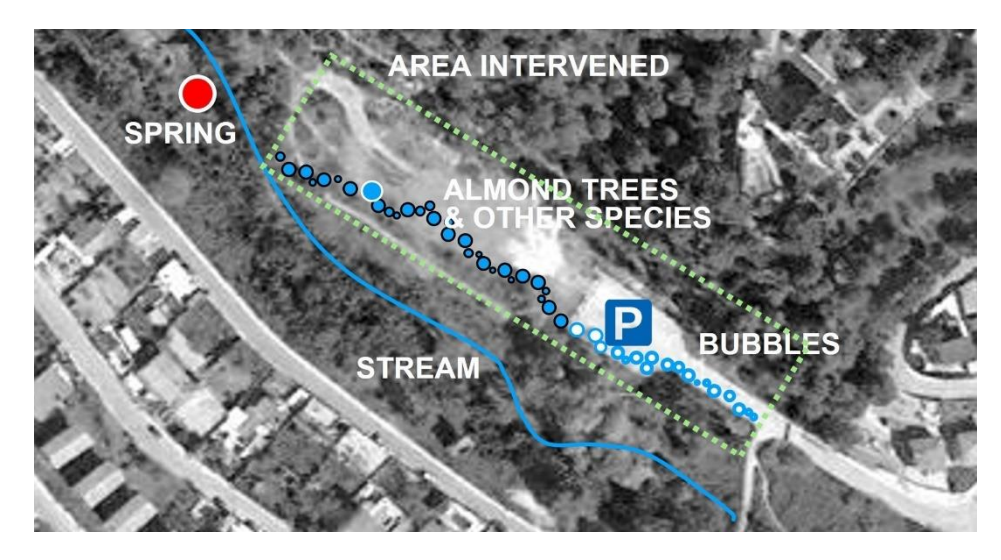
Figure 6. Masterplan of the interventions in the spring's surroundings following the conclusion of the visual preference mapping (VPM) analysis (P indicates parking lot area). The bubbles are blue circles painted onto the surface of the car park, and the other circles are the positions of the painted logs.

The masterplan formalized a series of hands-on actions to define the desired line for the path along the stream as passing through the most fragile section across the parking area and its immediate surroundings (Figure 6). The purpose of these small-scale tactical interventions was to claim back the area perceived as the least attractive by mobilizing the site potential and future care by the local community. The collaborative activity included painting blue circles on the car park surface; arranging cut logs into a pattern, also painted blue so as to produce a visual connection across the site; planting trees and bushes; and adding furniture (Figure 7).