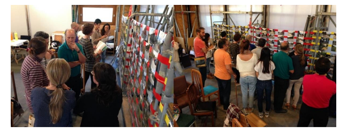
Figure 4. Participatory workshop with the neighbours (September 2017).

We summarize the steps that were taken between 2017 and 2018: