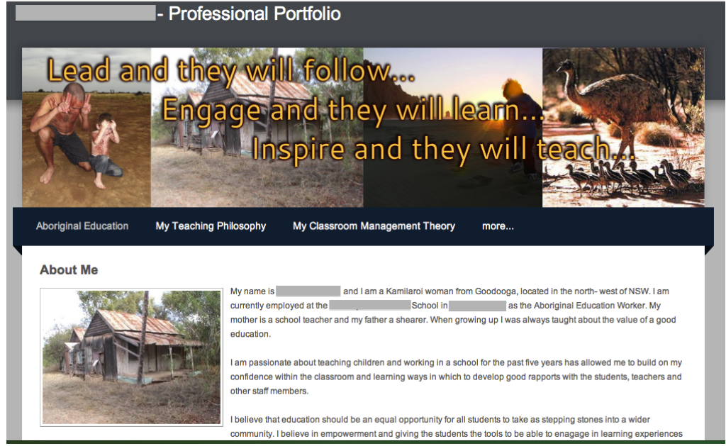
Figure 2: A personal yet professional home page

Embedding PDFs® or Word documents into a Weebly page (rather than using hyperlinks) required the Pro version of Weebly that, like Skype, is not free. Weebly Pro could facilitate access to Scribd (a very useful software tool for embedding annotated word documents) and more multimedia opportunities. Although the project was able to fund Weebly Pro for the students not all of them (for various reasons) were able to access it. This was a pity and needed to be taken into account when assessing, as ePortfolios created by preservice teachers with access to Weebly Pro were at some advantage over those without.