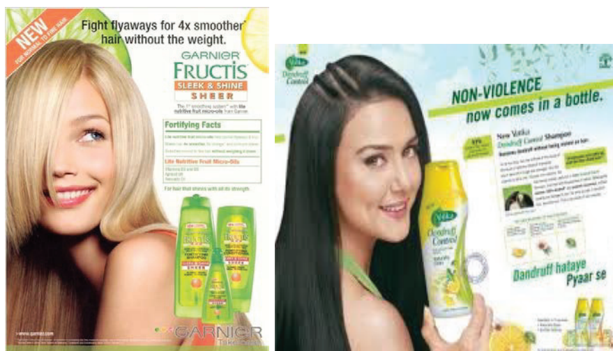
Figure 3. Examples of product promotions from two different eras.

In concluding the interview, the researchers asked Andrea where she had found the inspiration for the lesson. She said it was from the television program the Gruen Transfer – a program that deals with the deconstruction of advertising campaigns in a humorous way.