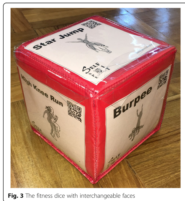
Fig. 3 The fitness dice with interchangeable faces

objective is to inject an element of game-play to fitness activities, and in turn increase students’ enjoyment while engaging in such exercises. Specifically, we designed a set of dice with all six faces covered using transparent film pockets that can hold paper or other flattened contents (e.g., CD/DVD discs). Using this design, each face of a die will be interchangeable, and, therefore, can be customized to the needs of users (see Fig. 3). Put in the context of the current study, teachers will be able to insert activity cards provided by the research team and then create their own based on the i) skill and fitness levels of their students, ii) equipment available for their classes, and iii) activities favored by their students. In the long run, we will encourage teachers to invite students to choose, or to create, activities for the faces of