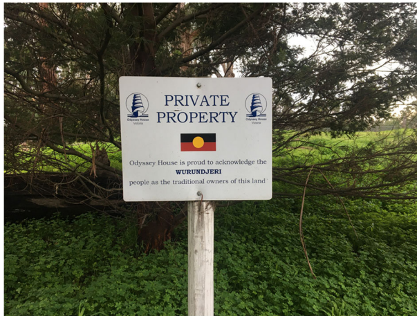
Fig. 1 A paradoxical text

struggling with substance addictions. Imagine a child reading this sign, fresh from learning about land rights in the Australian Curriculum. They might wonder how the sign's Wurundjeri acknowledgment can promote a resilience in responding to historic and contemporary impacts of colonisation while sitting beneath a dominant 'Private Property' header that exploits colonisation legacies. They might question how an organisation can endorse the Wurundjeri as the land's traditional owners while reinforcing Australian laws that institutionalised the dispossession of Wurundjeri land. They might wonder if the images of a ship refer to Captain Cook on the Endeavour, searching for land to colonise, rather than Odysseus' ship on a long journey home to Ithaca. They might reflect on the recent performance of Ziggy Ramo at an AFL game where he sang, 'There will never be justice on our stolen land'. This imagined paradoxical moment for the child is one of many they face in, and as a result of, language and literacy learning at school and beyond (Fig. 1).