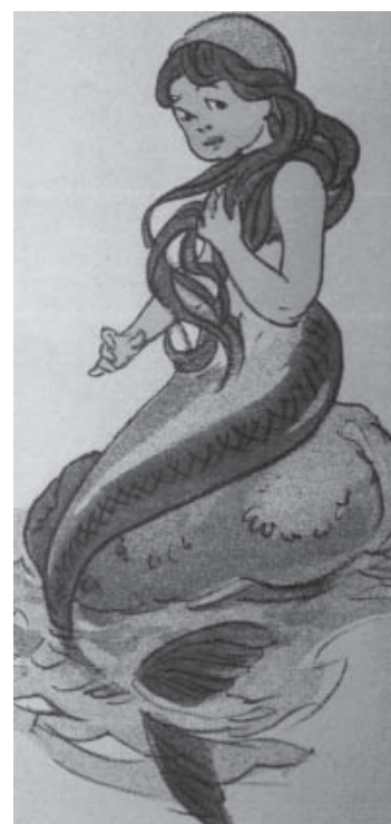
Pic. 3. Illustration by Walter Cunningham in Wondercap: adventures with the sandman by Muriel Olyott (unpaged).

across her chest, draws attention to that area of her body, suggesting a sexual consciousness. The line of her hip emphasises the female form. The mermaid is the object of a dual gaze; from the characters in the book and from the viewer outside the page. There is something here of what Patricia Holland calls «the ambiguous sexuality of the pre-pubescent girl» which appears in so many images of children in popular media 31 .