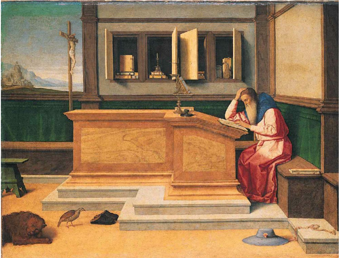
Image obtained by digital transmission. Used with permission. Any form of reproduction of this image without the consent of the copyright holders is prohibited.