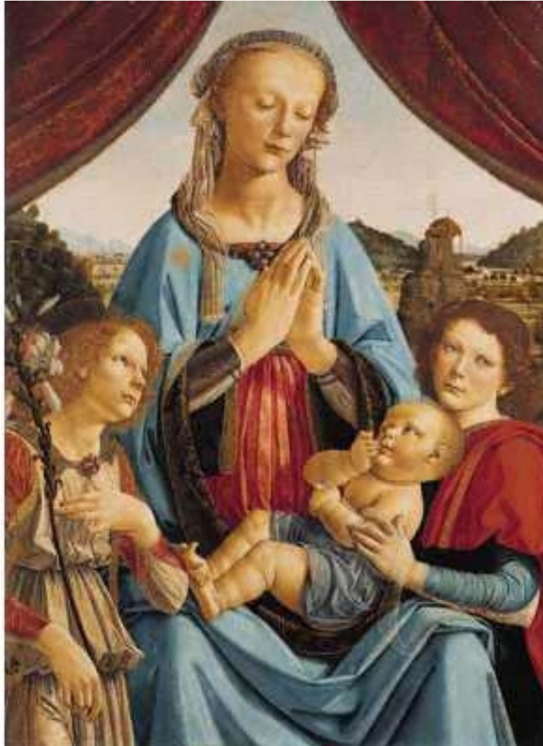
Image obtained by digital transmission. Photo © The National Gallery, London. Used with permission. Any form of reproduction of this image without the consent of the copyright holders is prohibited.