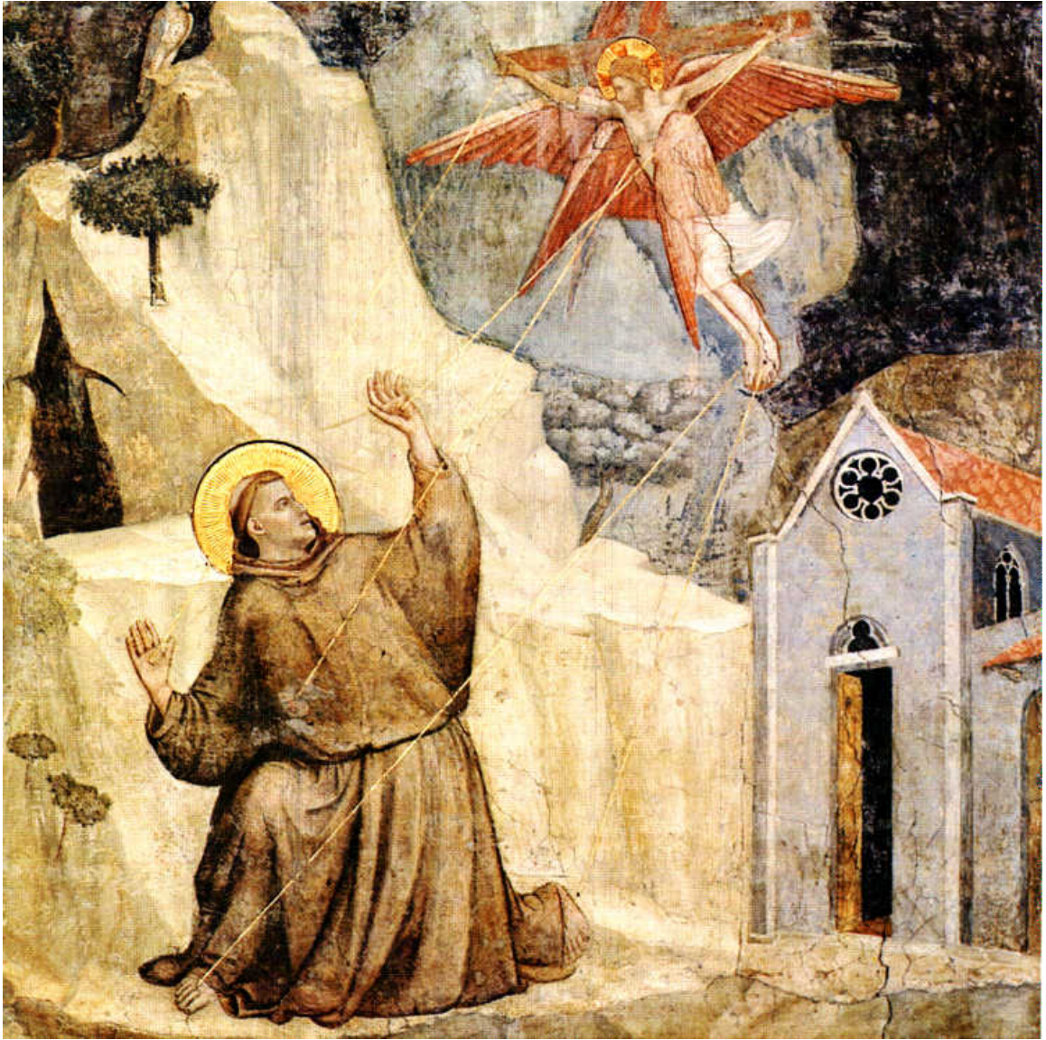
Any form of reproduction of this image without the consent of the copyright holders is prohibited.