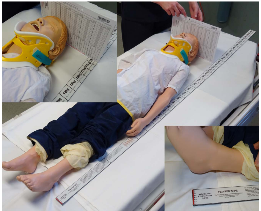
Figure 1 Images showing the demonstration of the Paediatric Advanced Weight Prediction in the Emergency Room (PAWPER) tape.

Advanced Weight Prediction in the Emergency Room (PAWPER) tape (figure 1) 15 16 and the Mercy method, that modified weight estimations using body habitus. 17–19