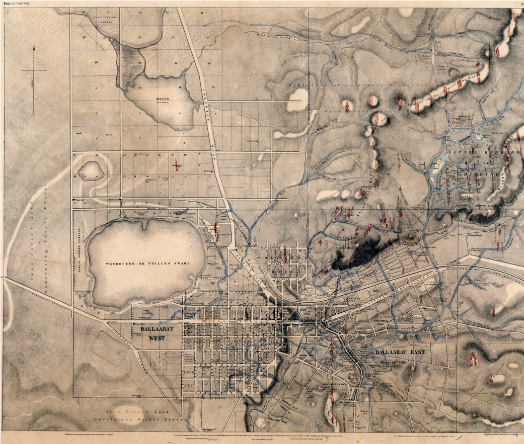
Figure 4: Map of the Ballarat region, showing auriferous leads and quartz reef and outcrops, compiled and drawn by Braché in 1861 (accessed from the University of Melbourne digitalised collection: http://hdl.handle.net/11343/23725 ).